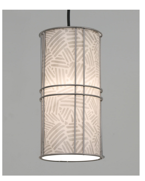
Luminaire P1204 shown with DL30 Roam

Luminaire PT1815L2 shown with DL21 Korie