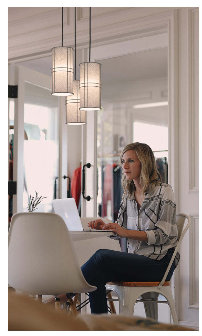
Luminaire P1204 shown with DL30 Roam