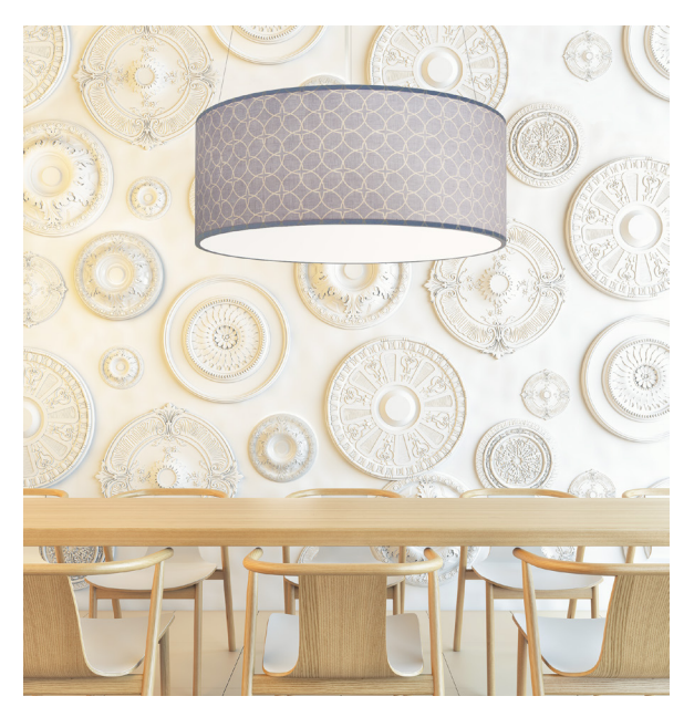
Luminaire P53414 shown with DL18 Medallion