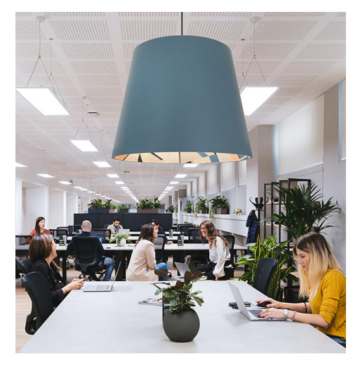
Luminaire PT3225L2 shown with DL28 Peak