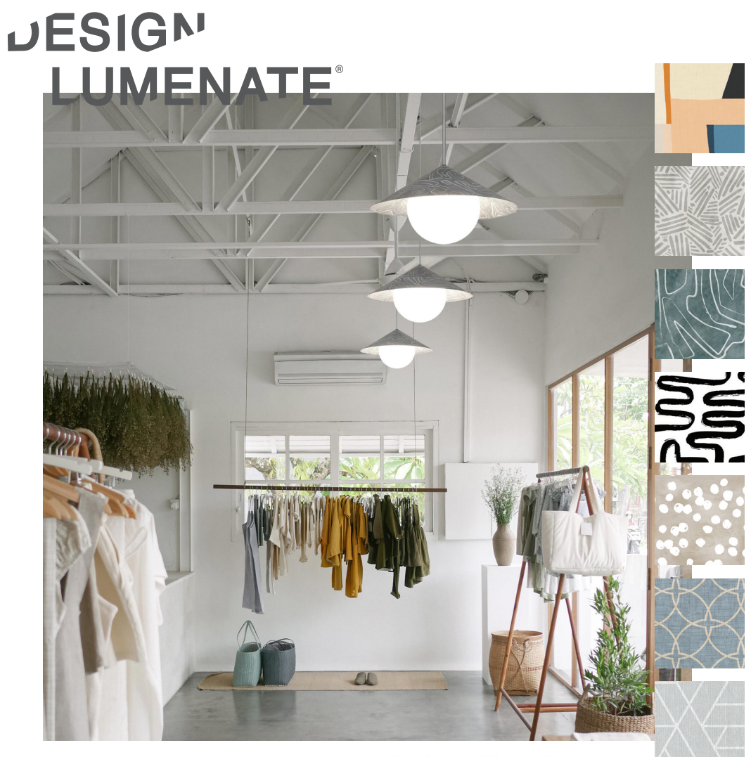
A unique line of printed diffusers influenced by the latest trends in interior design and fashion.