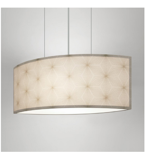
Luminaire P53012 shown with DL25 Celest