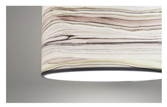
Luminaire P52314 shown with DL10 Surge